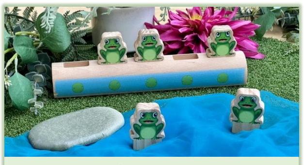
'Are there more frogs on the log or in the pool?'

By placing a pebble into the pool, children can play with placing the frogs in three groups (two in the pool and two on the log and one on rock, or three in the pool and one on the log and one on the rock). The children can explore the composition of smaller numbers too, such as two and one making three , or one and one and one making three . Adults can help children explore a range of combinations, joining in their creative story making with the frogs, as well as pointing out more , less and same as they compare the different groups of frogs.