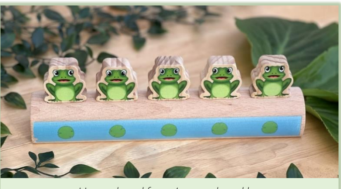
Unnumbered frogs / unnumbered log