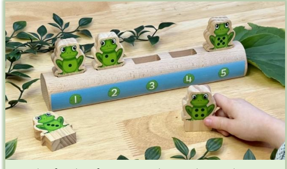
'This frog has four spots, where is the number 4?'

The numbered lily pads help teach children about the number sequence to five , supporting them to work with number lines