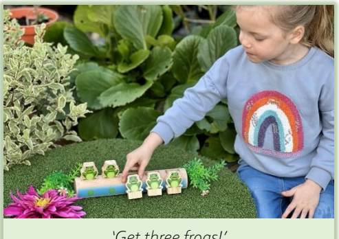
'Get three frogs!'