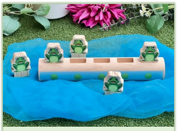
In front of the log, behind the log, next to the log

The Frogs on a Log resource can also be used for other maths learning opportunities. Counting the number of frogs' eyes offers opportunities to count to ten and to count in twos , for example. A key learning opportunity is to support children's spatial development. Placing the frogs in different positions along the log provides opportunities to learn about positional language such as next to and between , as well as on the log or in the pool. This can be particularly valuable when using the numbered frogs as children can talk about two as ' next to one', ' between one and three', and ' nearer to one than five', for example. If the log is placed in the middle of a homemade pool, then children can choose where the frog will jump into the pool – behind , in front of or next to the log.