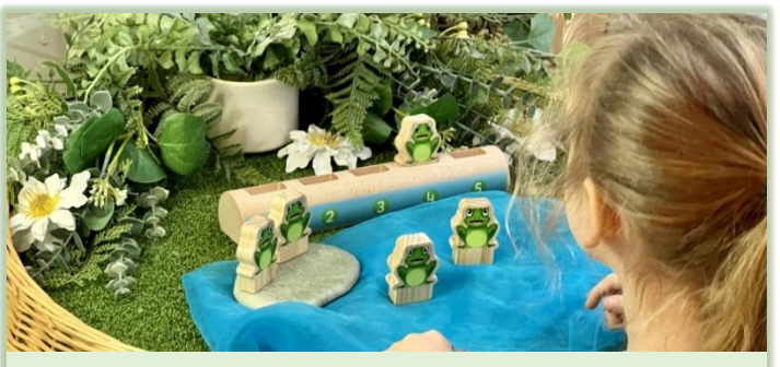
'There is the same number of frogs on the rock and in the pool!'