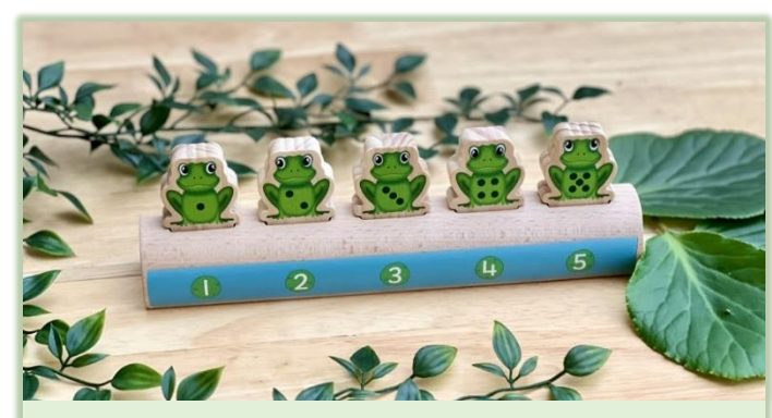
Frogs numbered with spots / log numbered with numerals

The five frogs and the log are double-sided. One side has numbered frogs and lily pads so that children can learn numeral meaning and the order of the numbers one to five . The other side is unnumbered so that children can count and subitize 'how many ' frogs there are on the log, being able to place the frogs in any order, and also put them in groups. It is important that children learn both the order of the numbers (ordinality or sequence) and the meaning of the numbers (cardinality or 'how many-ness') as these form the essentials of number sense and provide a secure foundation for future mathematics.