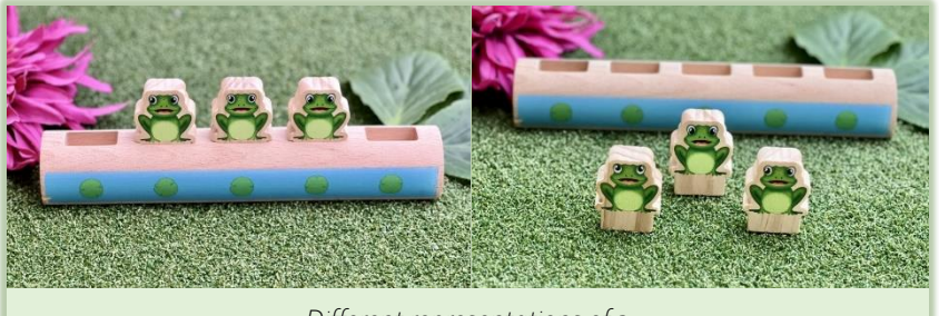
Different representations of 3

Subitizing (instantly recognising how many without needing to count) is important for early number learning. Children can practice subitizing the number of frogs, recognising 'how many' when the frogs are lined up on the log but also in different arrangements off the log.